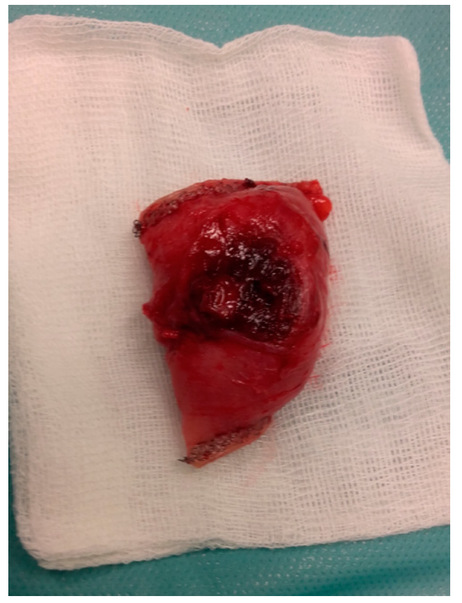
Figure 3. The dissected part of the small intestine