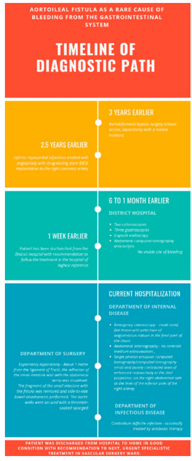
Figure 5. Graphic illustration of the diagnostic path