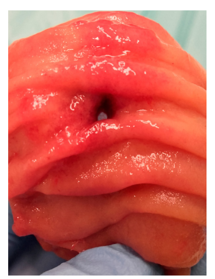
Figure 4. The dissected part of the small intestine, the internal view of the specimen