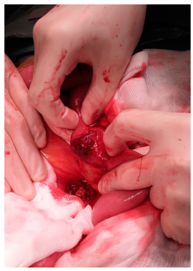
Figure 2. The view of the operating field

The condition discussed resulted from adhesions of the prosthesis to the adjacent intestinal wall and the formation